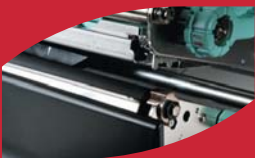
Adjustable sensor kit