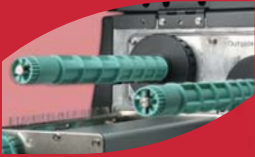
Ribbon supply and rewind module