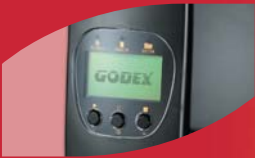
Upgraded Graphic LCD